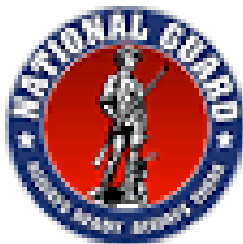
SD Army National Guard Lyn Waldie