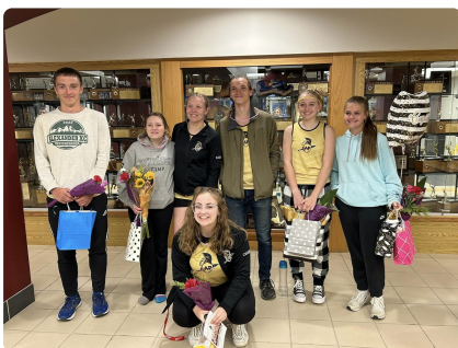
AP's track team celebrated their Senior Night on April 25th in a ceremony held after the meet.