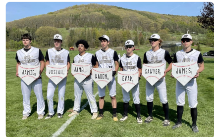
AP's baseball team celebrates their Senior Night in Wednesday's 9-0 shutout victory over Jasper-Troupsburg.