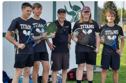
AP's tennis team celebrates their Senior Night in Tuesday's 4-1 victory over Andover/Whitesville.